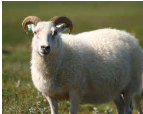
This is a goat.