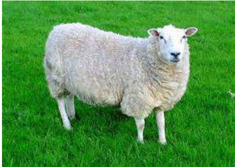
This is a sheep.