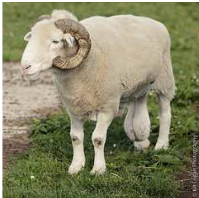
This is a ram. He is a 'boy' sheep.